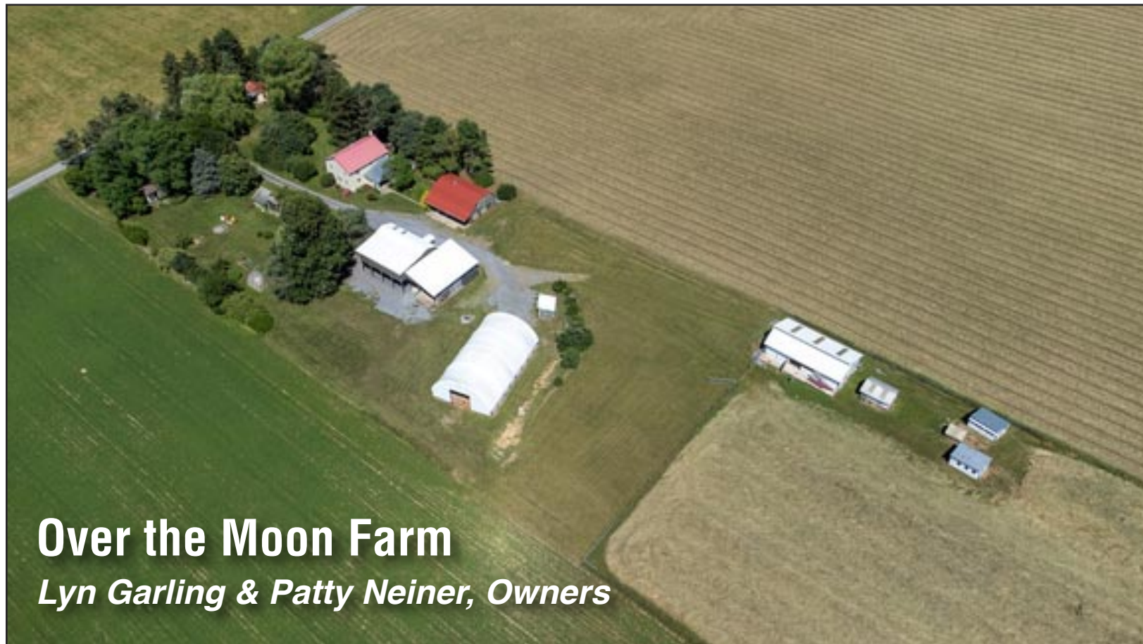
Over the Moon Farm Lyn Garling & Patty Neiner, Owners

18' Grumman Alum. Canoe; Paddles, Life Jackets; Water Gear; Camping Gear; Complete Camping Kit; 2003 Pontiac Vibe w/161, K mls. w/Hitch.